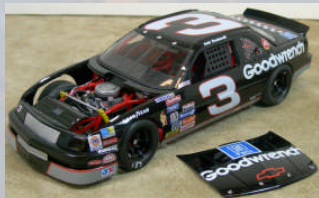
Top-Matt's #3 Lumina

Until next time, keep your sprues empty Matt