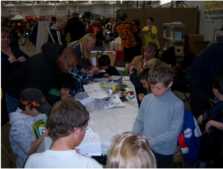
Some photo coverage of the Make-n-Take on the 17th.