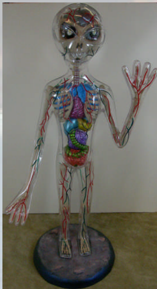
Below- Rob's Visible Alien