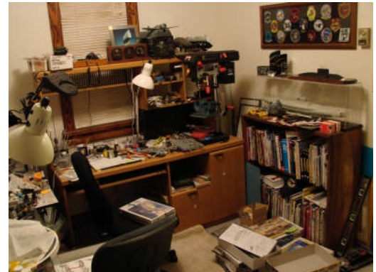
Dekkers model lair, aka dungeon, or as he likes to call it, "Where the magic happens"