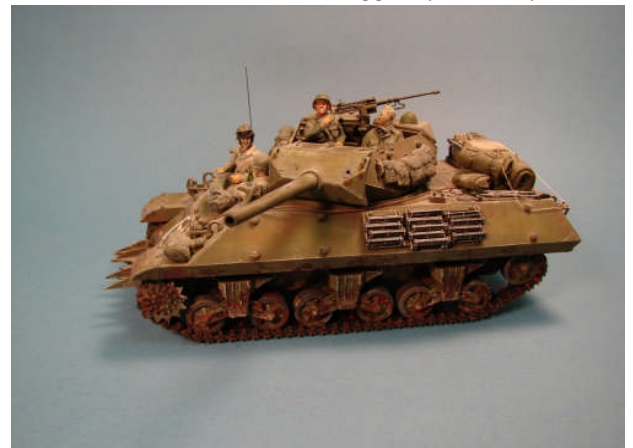
M-10 Tank Destroyer by Pete Dunn