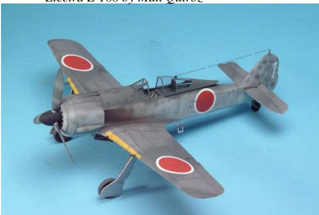
Japanese Fw-190 by Dekker Zimmerman