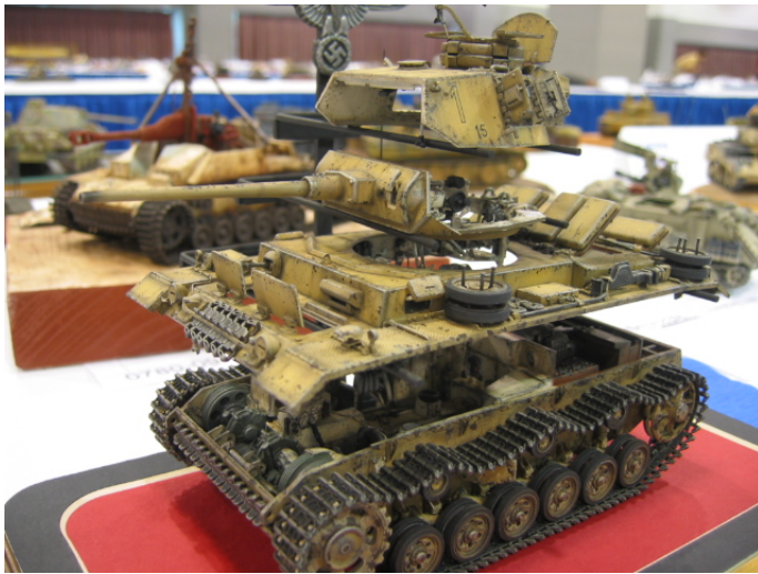
Tiger I with abandoning crew.

Panzer III– Amazing amount of work and I don't believe it even placed in it's category.