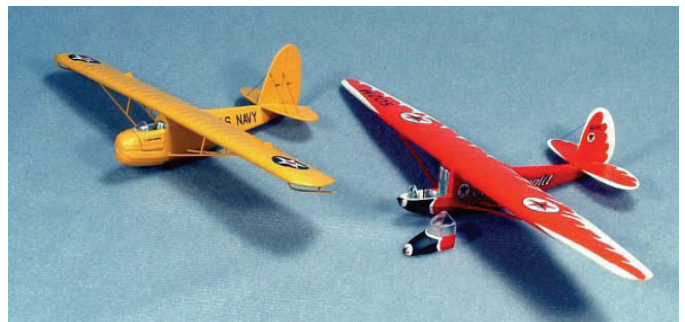
1/72 Franklin PS-2 Gliders by Chuck Holte (as seen on www.aircraftresourcecenter.com )