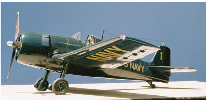
F6F5 Hellcat "Blue Angels" 1946

WATCH YOUR E-MAIL FOR LOCATION AND DATE INFORMATION!!