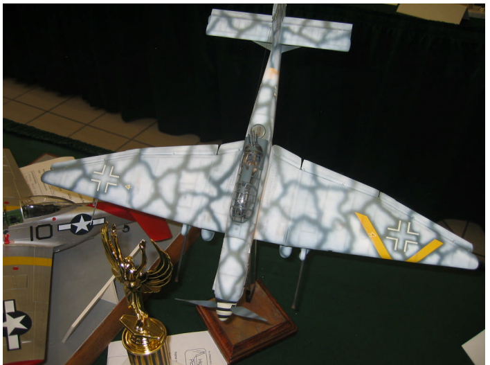
Dekker Zimmermans "Tiny" Ju-87 Dive Bomber in 1/32 mit trophy....first place I'm sure.